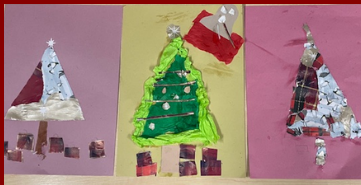
Year 2 Christmas artwork