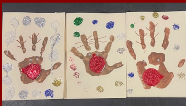
Reception Christmas artwork

Polite Reminder – Only 1 key ring on book bags please due to storage space. Thank you.